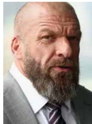
Paul 'Triple-H' Levesque